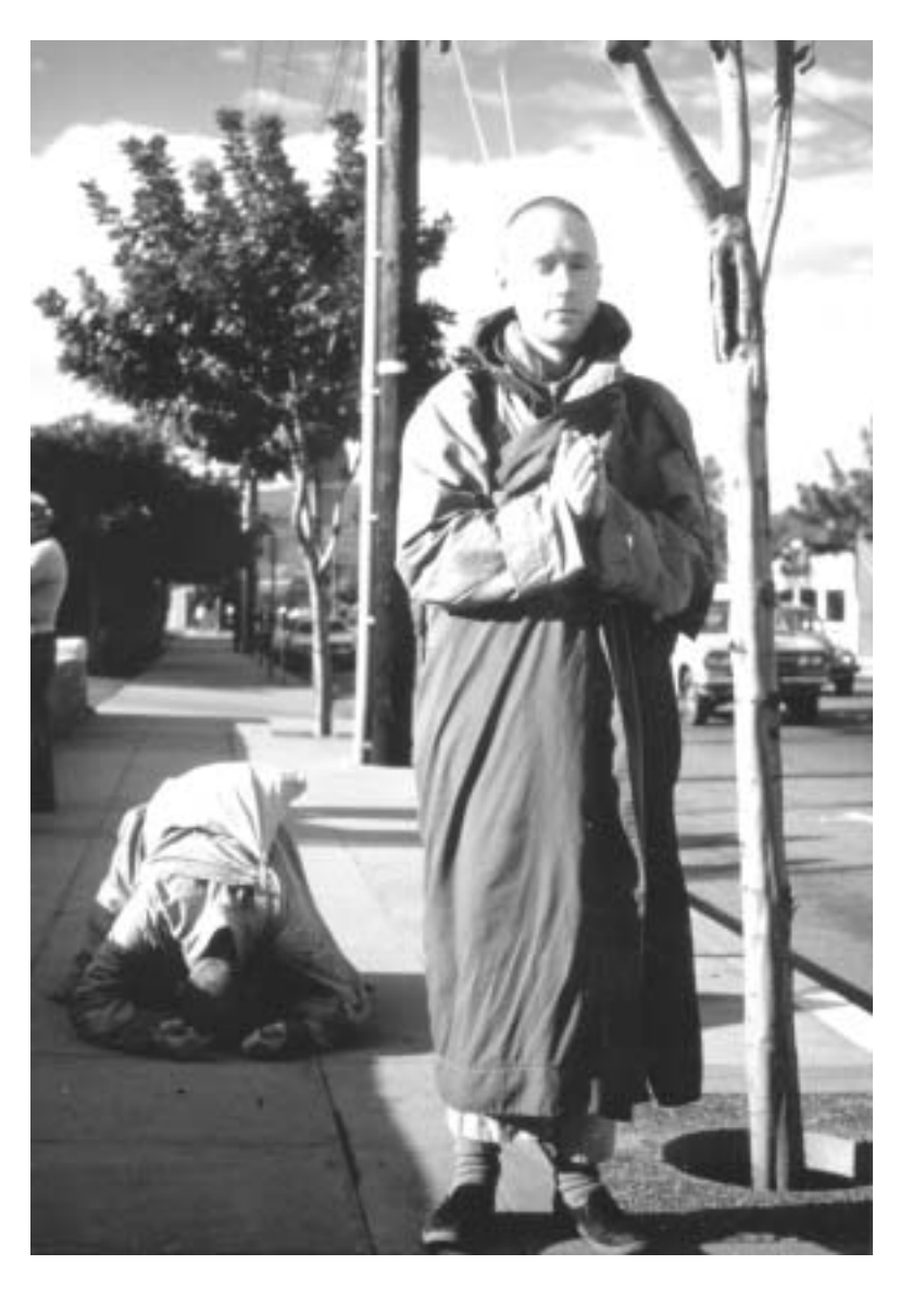
San Luis Obispo January, 1978