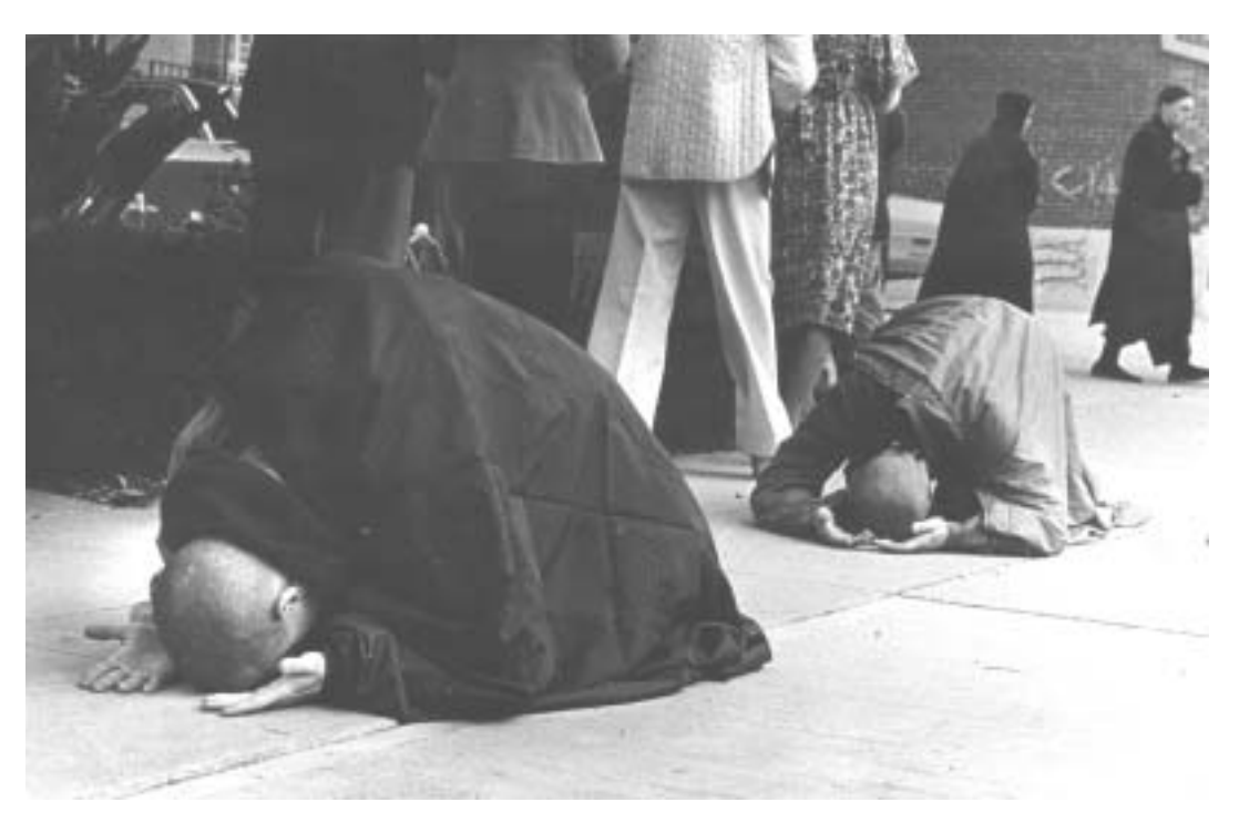
Gold Wheel community send-off. Circumambulating the bowing monks while reciting the Great Compassion Mantra.