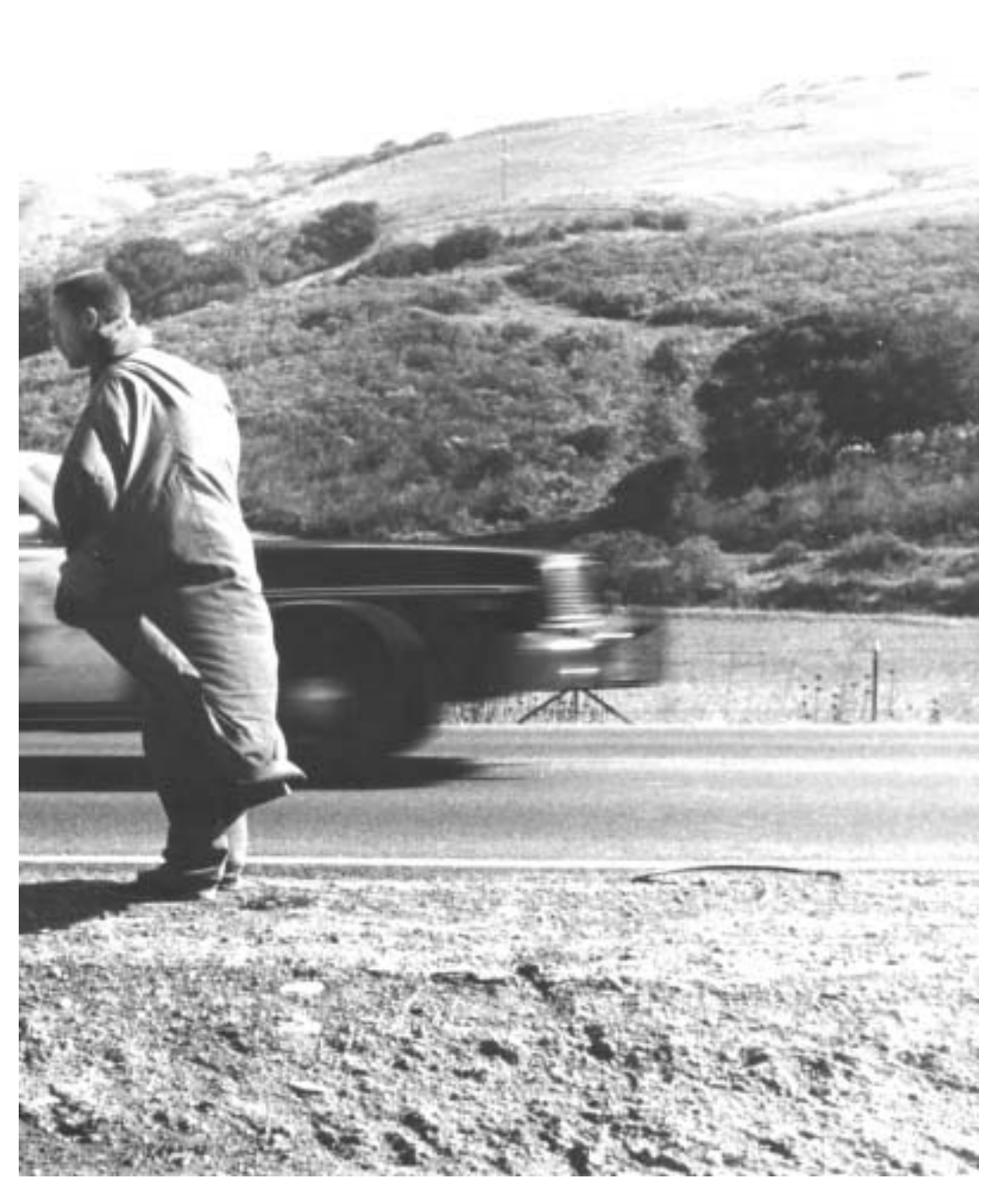
for the monks' safety. June, 1978.