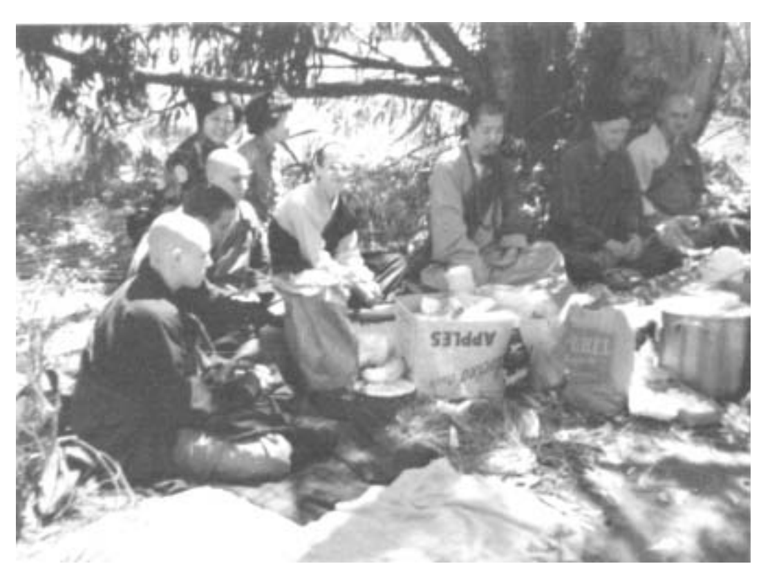
The Master and disciples receive offerings at the noon meal and share Dharma with the donors.