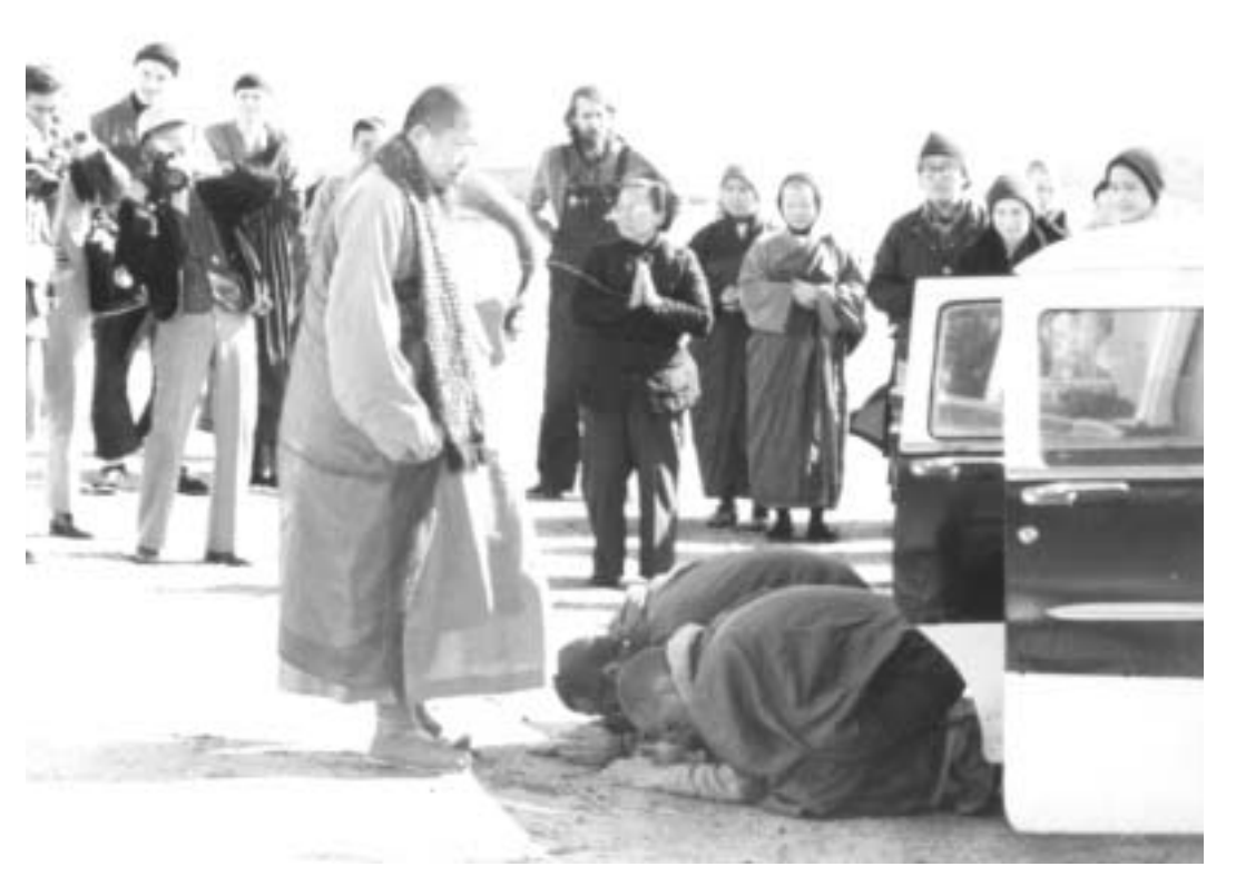
Venerable Master Hua and cultivators from Gold Mountain Monastery visit the bowing monks. Nipomo, Central California.1978.