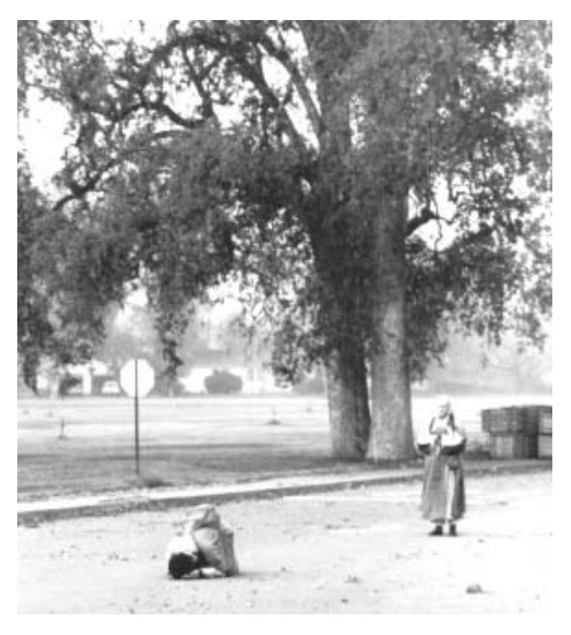
Arrival at the City of Ten Thousand Buddhas on a foggy morning. November, 1979