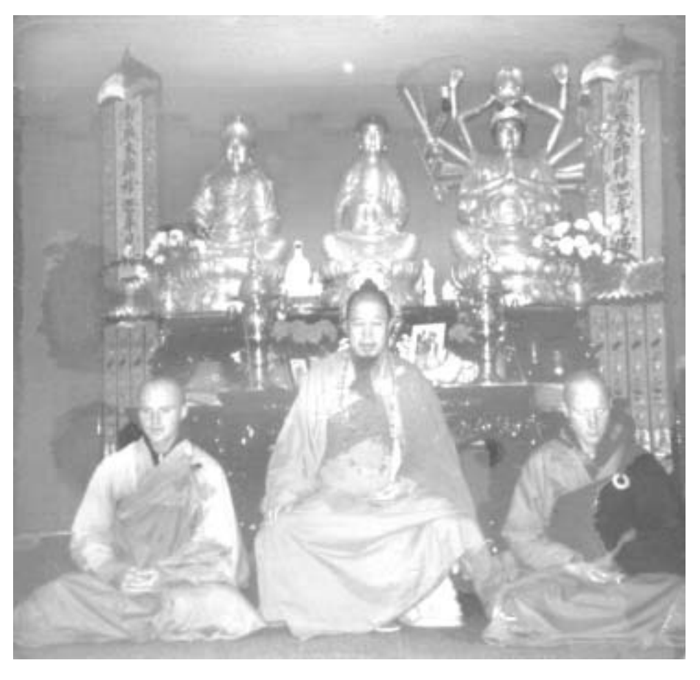
In the Buddha Hall at Gold Wheel Monastery after receiving instructions from the Venerable Abbot. November 1977