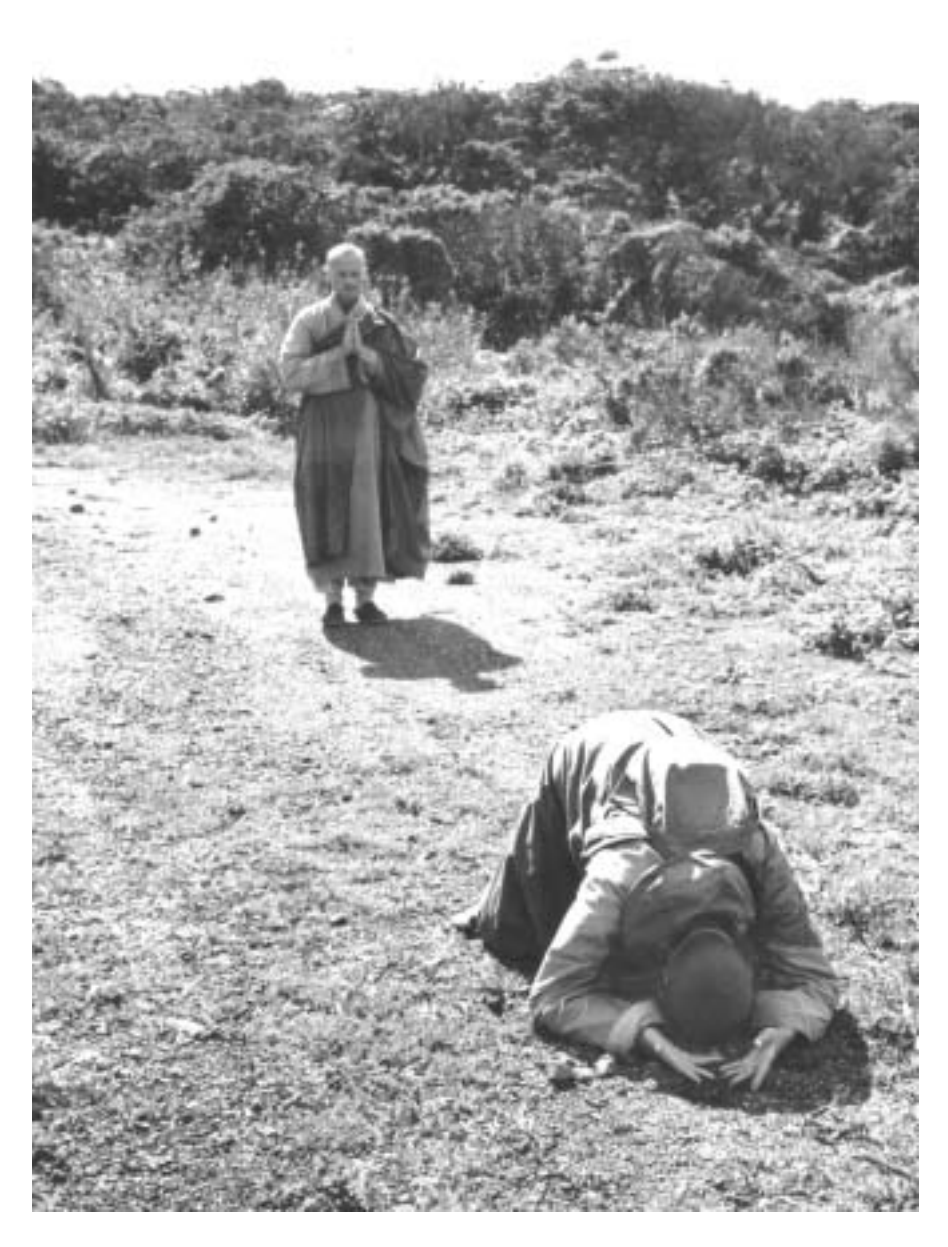
Bowing in place in a Big Sur roadside turnout. May 1978