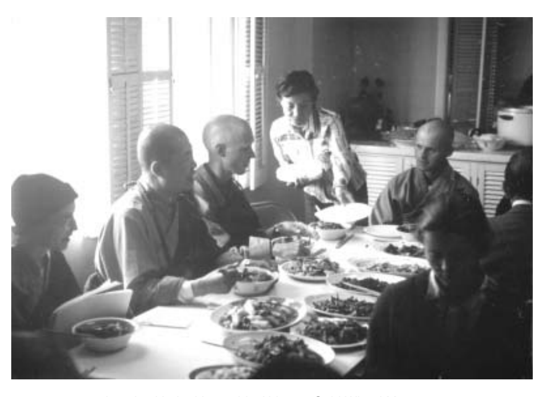
Lunch with the Venerable Abbot at Gold Wheel Monastery. April, 1978