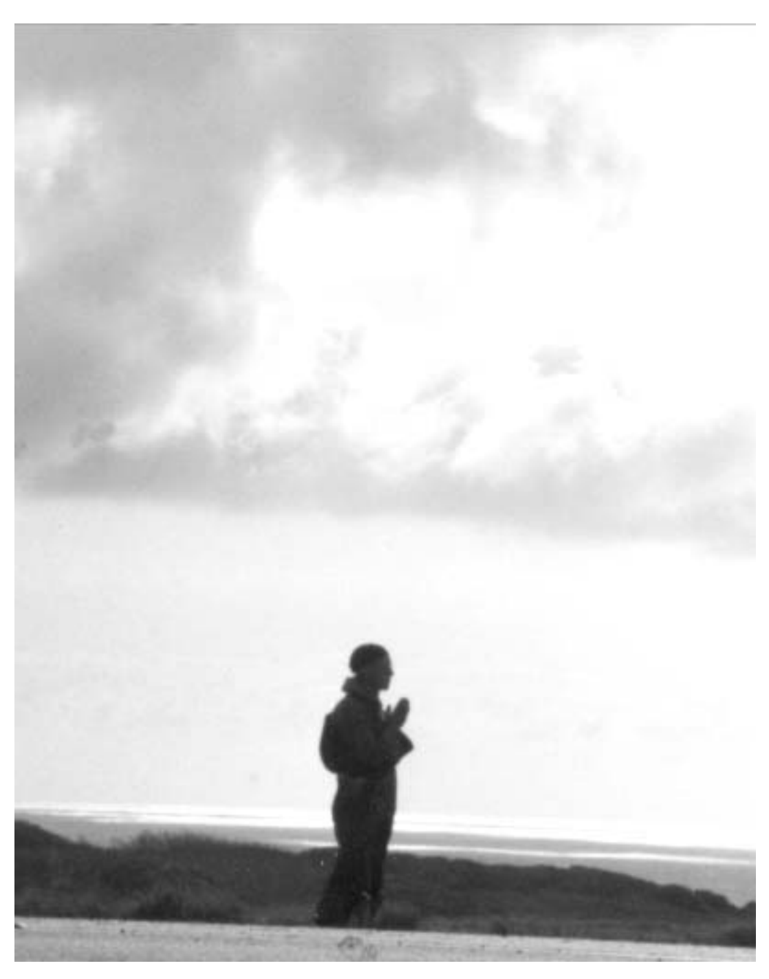
near San Gregorio, Pescadero coast. 1978.