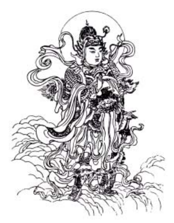
Dharma Protector Wei T'o Bodhisattva