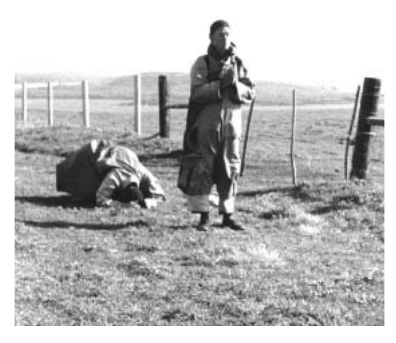
Bowing on high cliffs overlooking Big Sur coastline. June, 1978