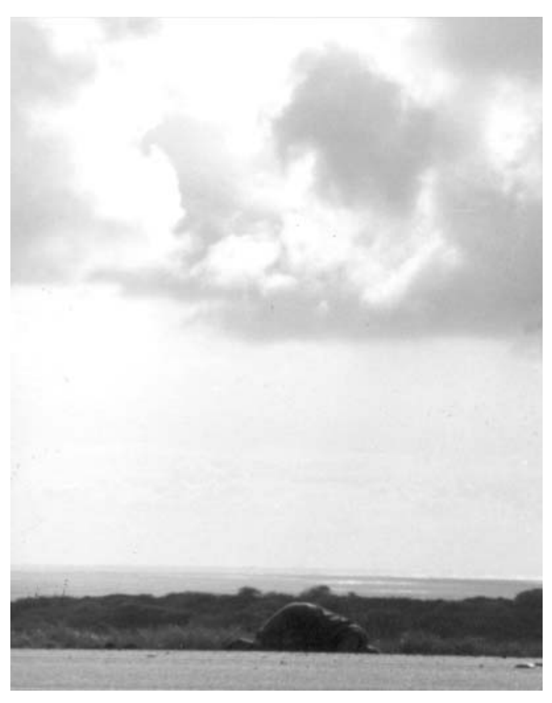
Final bows at sunset, along the Pacific Ocean