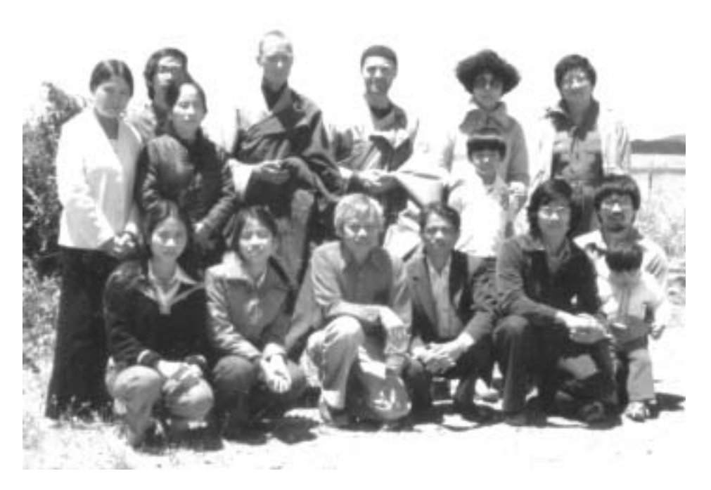
Lay disciples come often to the bowing site, bringing food and encouragement.