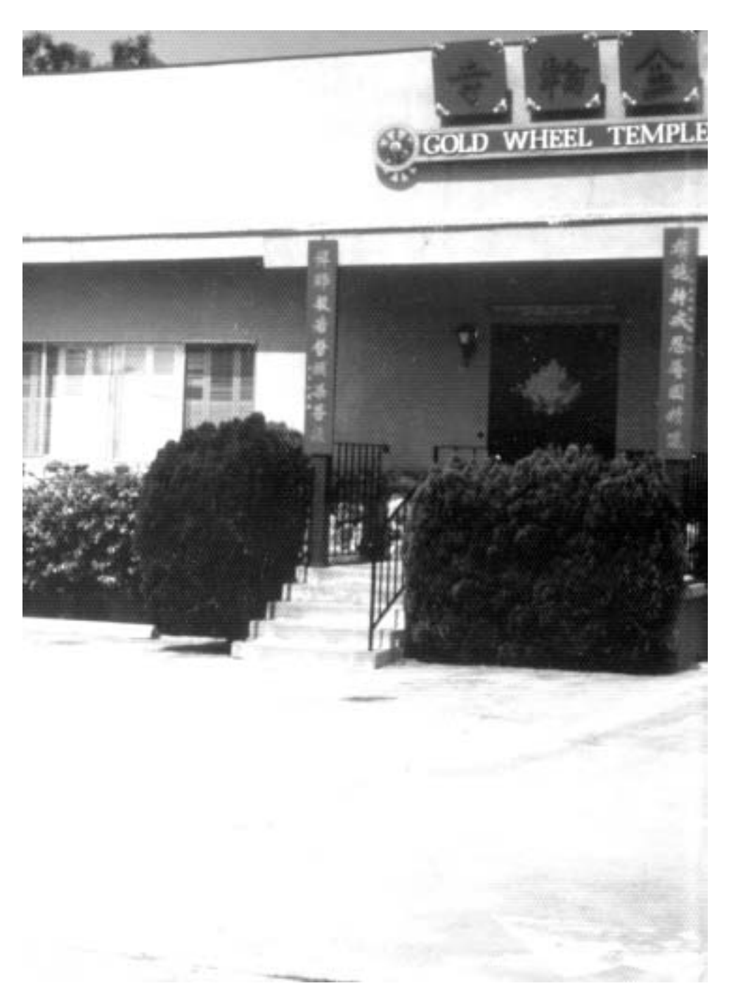
Gold Wheel Monastery, South Pasadena. November 1977