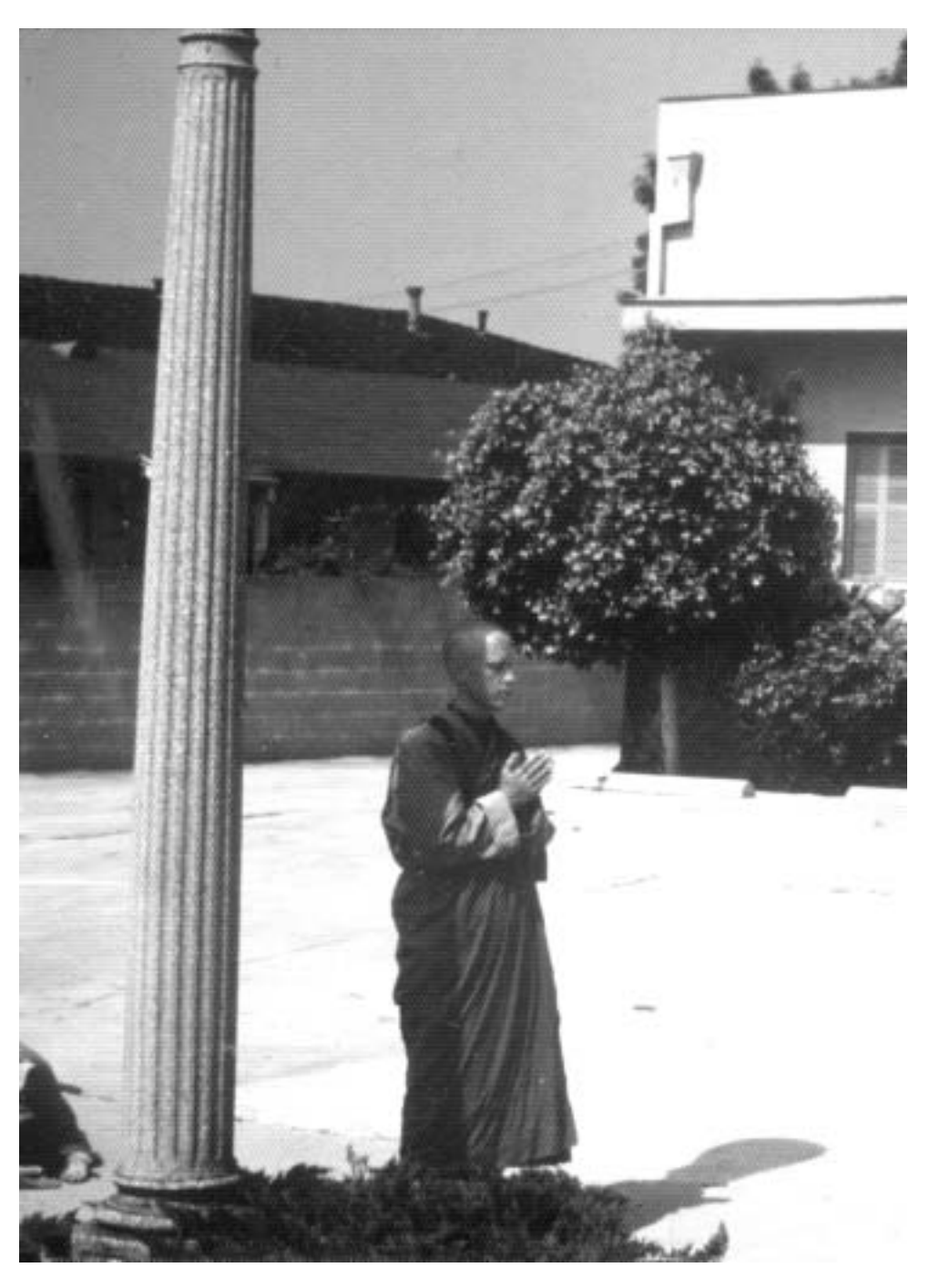
Returning to Los Angeles for instruction. Bowing in front of