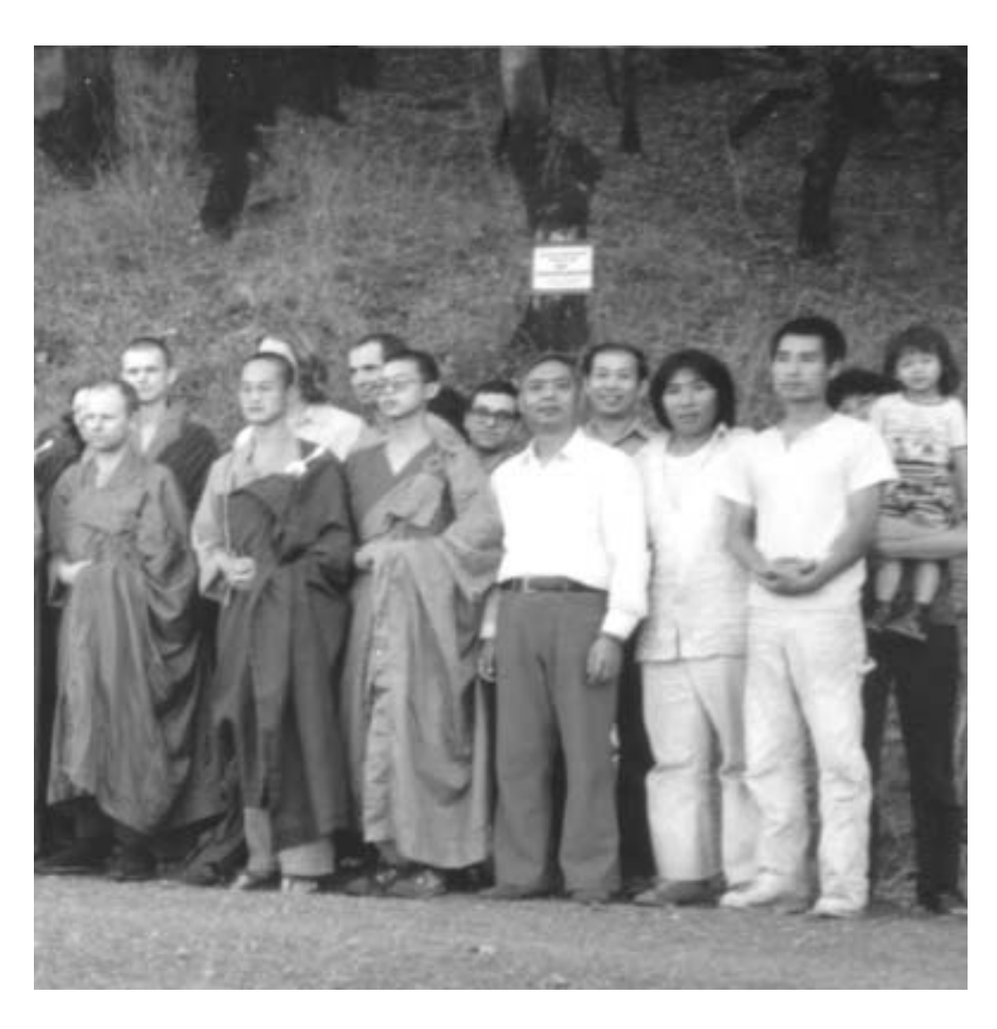
"...That's the way it is in the presence of the Master: whatever happens happens deep and is not soon forgotten. And always expect the unexpected!"