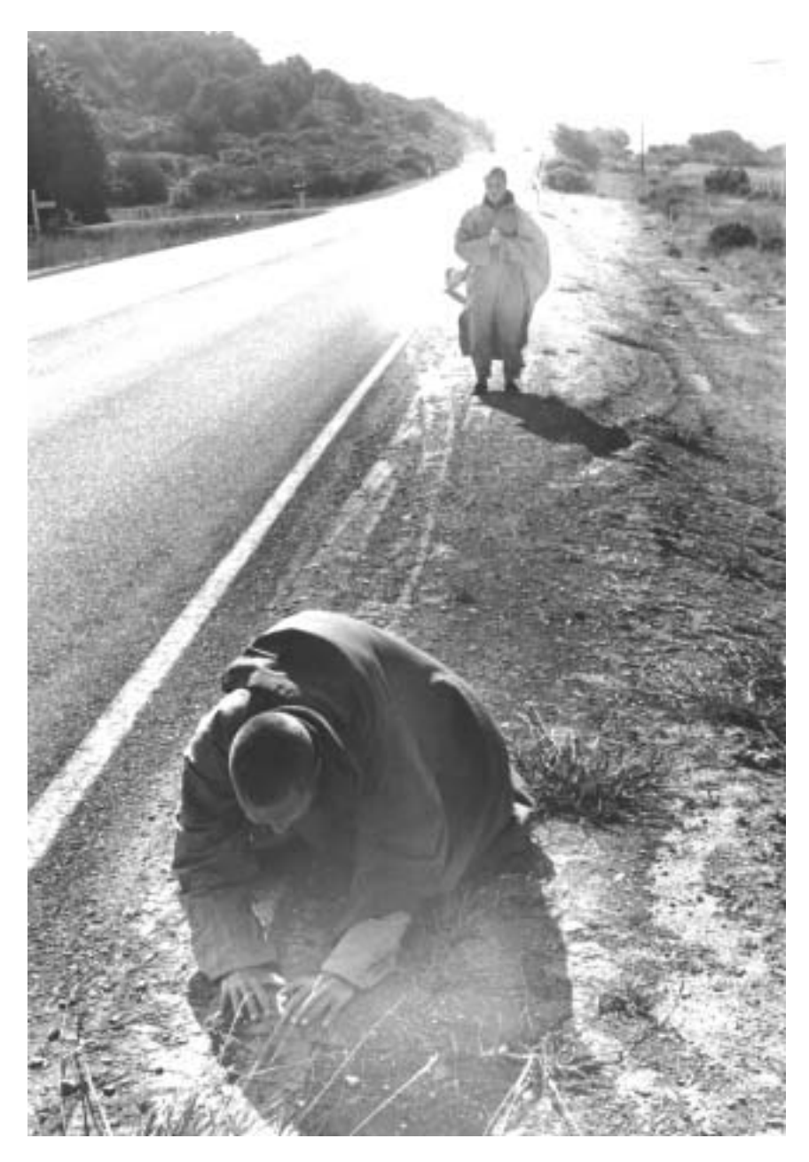
On the Nipomo Mesa. December, 1978