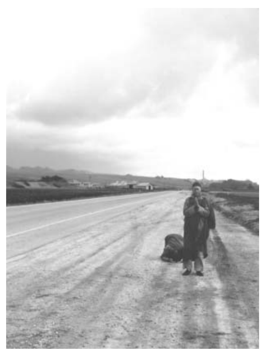
Bowing between winter storms near Morro Bay. February, 1978.